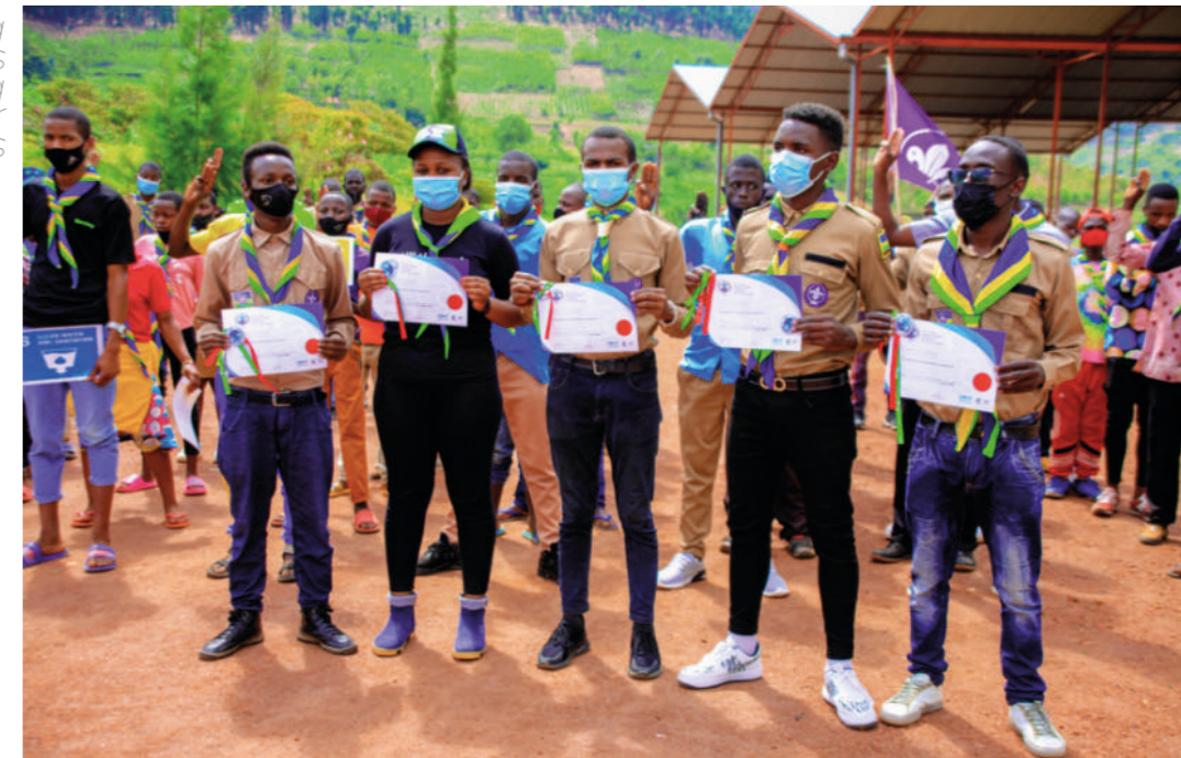
Young leaders receiving their awards

According to some studies, this is the proportion of bottled water containing plastic particles.