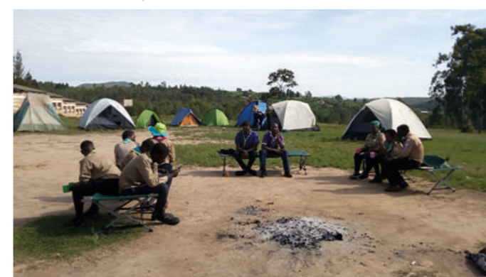
Patrol Camp, 2019