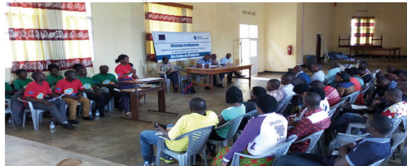
Nyamasheke Town-Hall Dialogue, 2019

RSA “Ubufatanye Mu Miyoborere” Field Coordinator highlighted that the project implementation brought a positive impact to all districts and involved individuals. The training, technical support, coaching, and stakeholder meetings organized during the project implementation led to the enhanced skills and competencies among citizens, Scouts-Researcher, and local leaders. As example on things scouts advocated for, includes maize harvests discarded by the buyers at Ngoma Dis-