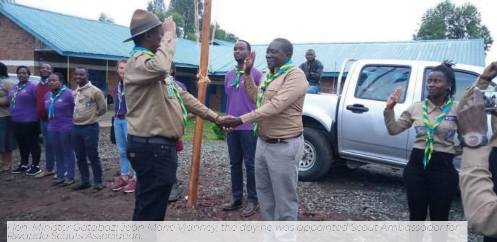
Hon. Minister Gatabazi Jean Marie Vianney, the day he was appointed Scout Ambassador for Rwanda Scouts Association.