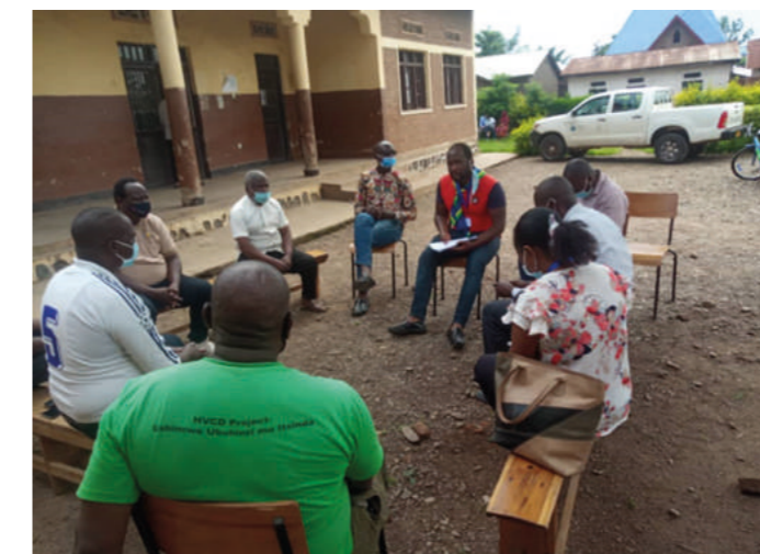
Baseline Data Collection

In the end, we noted that close collaboration with local Authorities from District to the village level and all partners in project yield good results, even if there were changes of leaders. Having a base at the grass-roots level and making sure that it is active is very key to maintain good collaboration with local leaders with flexibility.