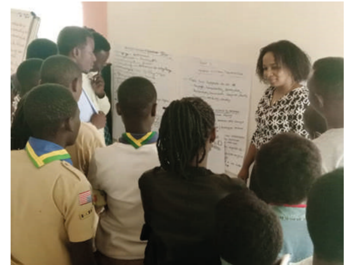
Common Ground Approach Training

The project was appreciated by participants and shared project action plan was approved in every district. Collaboration strategy between all partners was agreed by