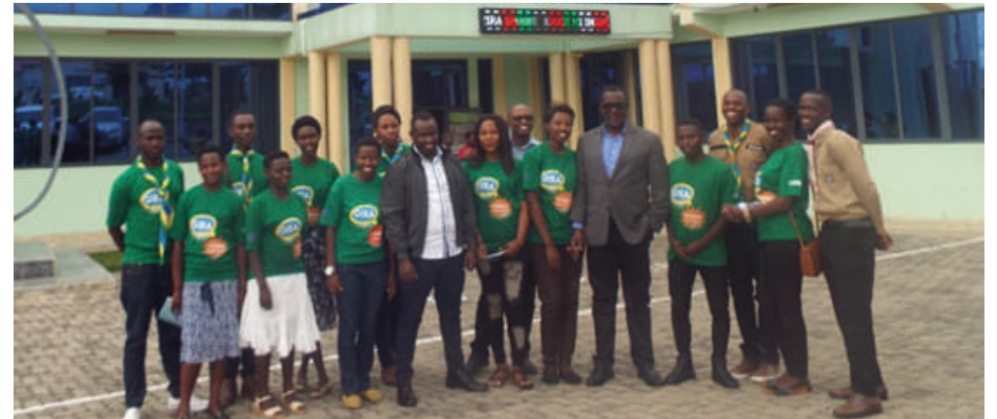
Ruhango Scouts-Researchers with Search Officials