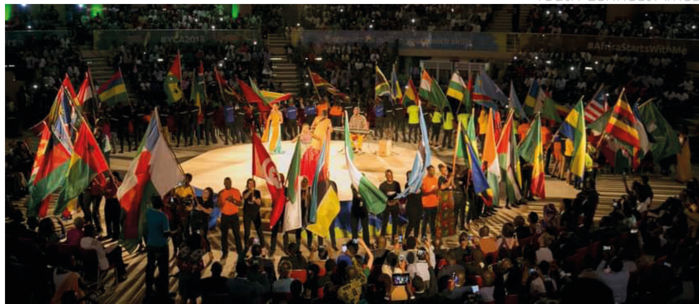
Youth Connect Africa

Rwandan History are considered as the strongest experience in building peace in the community or society.